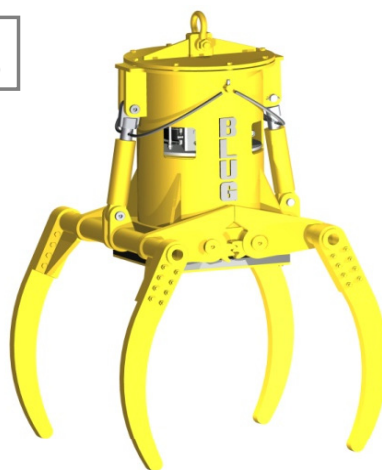
Structure validated by Finite Elements Analysis

Arm's design with optimal penetration that allows full loading in all the operations thanks to a kinematic design at lifting and penetration mode